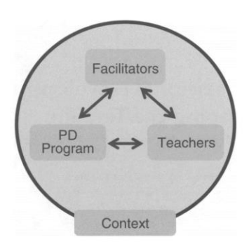
Figure 1: Elements of a professional development system (Borko, 2004).

The field of education is ever changing as a result of new policy and new research-based approaches to teaching and learning. These constant shifts in the field often force schools and school districts to constantly update their professional learning goals for teachers (Elmore, 2004). Due to constant shifts in the field and the varying needs of teachers, not every form of professional development is relevant to all teachers. Therefore, there is a need to study and identify alternative approaches to professional development to supplement conventional professional learning that teachers receive, with the goal of meeting their varying needs of teachers and, in turn, the educational needs of their student populations.